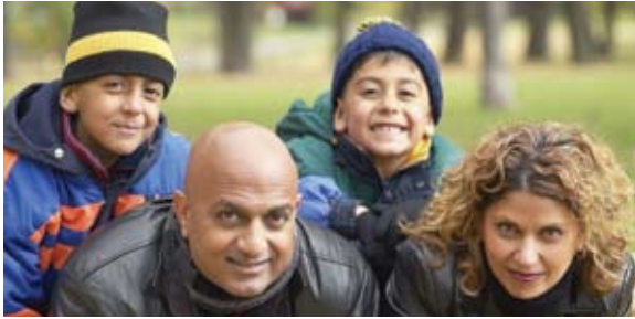
Office of Juvenile Justice and Delinquency Prevention, Office of Justice Programs, U.S. Department of Justice. Points of view or opinions in this document are those of the Institute for Intergovernmental Research® and do not necessarily represent the official position or policies of the U.S. Department of Justice.

For more information about gang-related documents and materials, contact the Juvenile Justice Clearinghouse at (800) 638-8736.